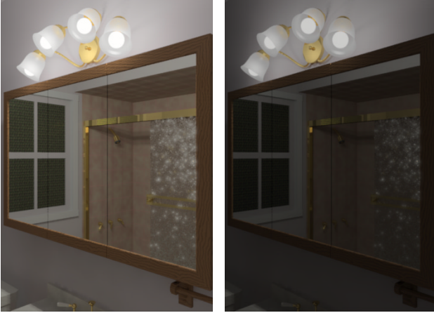
Figure 2: Tone mapping function TM(L) applied directly to pixel luminances. Left: bathroom scene from 11 , right: dimmed to 1/10000 of the original level.

mapping operation. Our function was constructed with no consideration of preserving image details. On some images, however, applying just this function directly to pixel luminances produces satisfactory results. An example is shown on Figure 2 where we present bathroom scene used in 11 under two different illumination levels to demonstrate the operation of TM(L) alone.