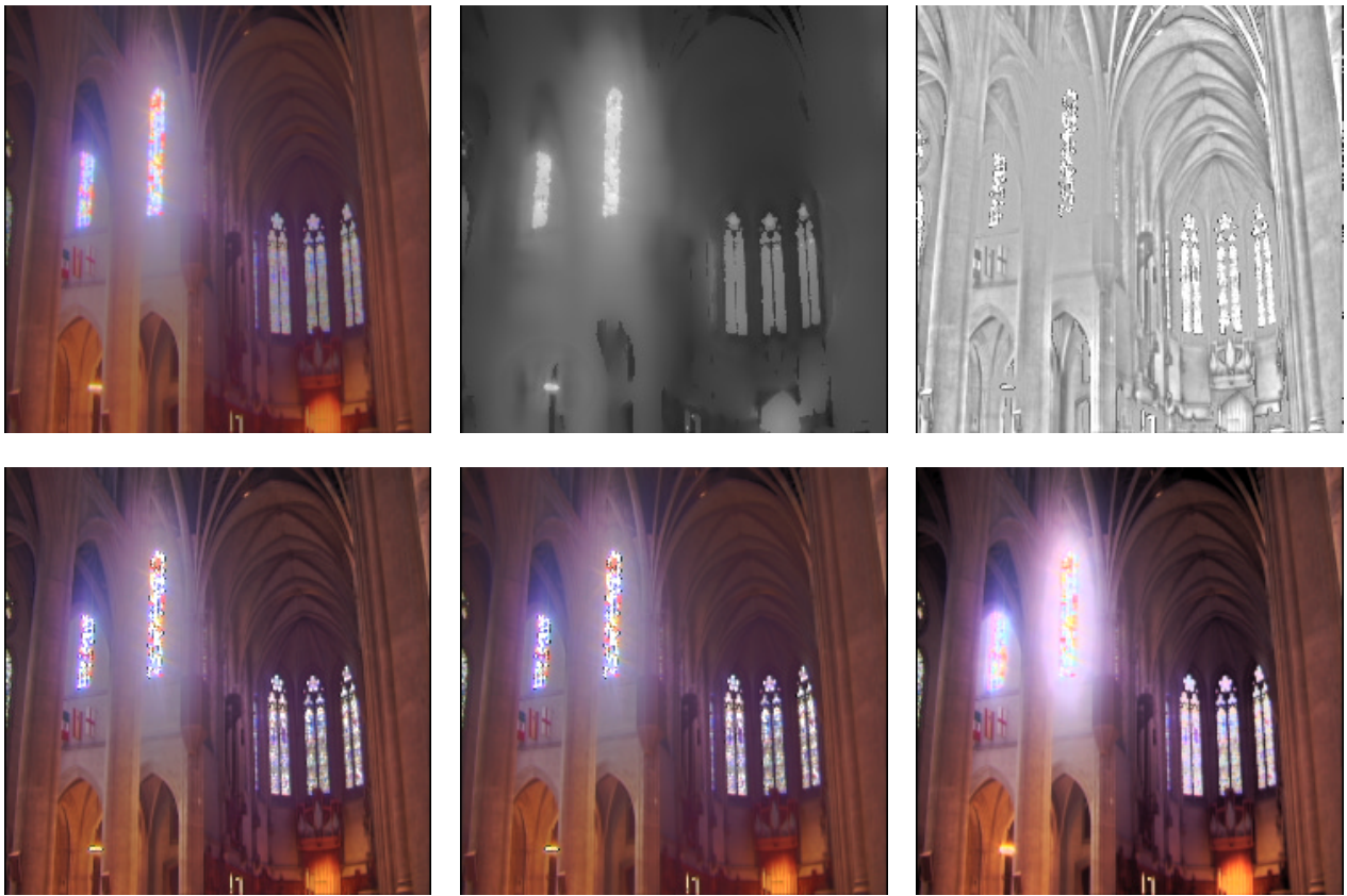
Figure 3: Operation of our algorithm. In reading order: a. application of TM(L) to pixel luminances, b. computed adaptation image after tone mapping by TM , c. details image (midlevel grey corresponds to value one), d. final result using equation 2, e. same using visible contrast definition (equations 3 and 4), f. histogram-based tone mapping 11 result.