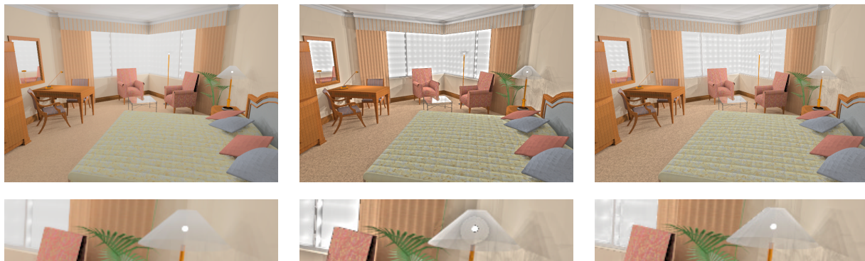
Figure 4: Tone mapping with different restrictions on local contrast |lc(s, x, y)| . Left: TM(L) directly applied to pixel luminances (formally, |lc| < 0 ) Middle: |lc| < 0.5 - note some artifacts due to halos and false jumps in adaptation level. Right: |lc| < 0.1 - a better overall choice for this image. Corresponding detail views are also shown. Original image is proposed Burwood Hotel Suite Refurbishment. Interior design - the Marsh Partnership, Perth, Australia; computer simulation - Lighting Images, Perth, Australia. Copyright ©1995 Simon Crone.