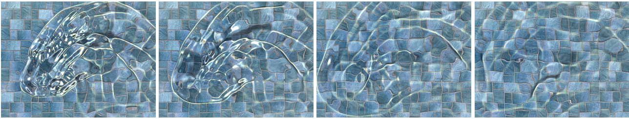
Fig. 6 Frames from an animated sequence captured from our real-time water simulation and rendering system.

void Pass2( out float4 color : COLOR, in float2 P_G : TEXCOORD0, uniform sampler2D inColor0, uniform sampler2D inColor1 ) { float val = 0; val += tex2D( inColor0, P_G + float2( 0, -3 ) ).r; val += tex2D( inColor0, P_G + float2( 0, -2 ) ).g; val += tex2D( inColor0, P_G + float2( 0, -1 ) ).b; val += tex2D( inColor0, P_G ).a; val += tex2D( inColor1, P_G + float2( 0, 1 ) ).r; val += tex2D( inColor1, P_G + float2( 0, 2 ) ).g; val += tex2D( inColor1, P_G + float2( 0, 3 ) ).b; color = val; }