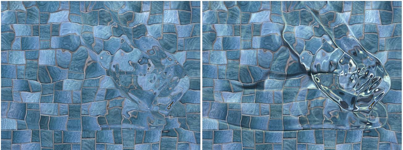
Fig. 1 The image on the left shows a water surface defined by a height field rendered with reflections and refractions. The image on the right shows the same water surface with caustics computed using our method.